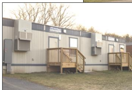
Due to increasing enrollment, Pleasant Valley will be dependent on the use of 11 portable classrooms to accommodate its growing population until its new building can be constructed.